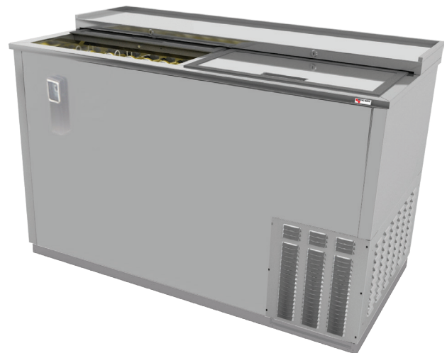
MDW50S Stainless Steel